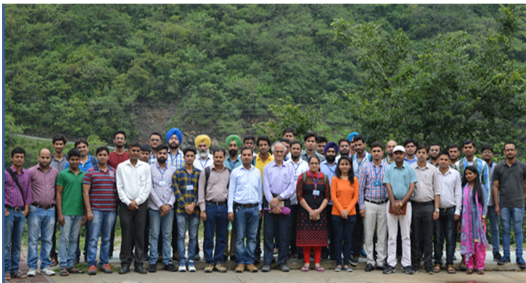
Group photo with participants