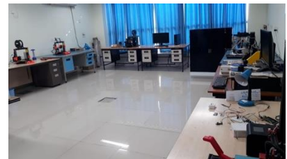
Fig 7 : Mechanical Packaging Lab