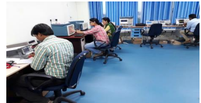
Fig 6 : Testing & Calibration Lab