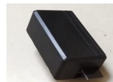
Fig 1 : Smart Washroom Product