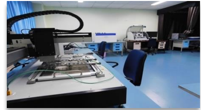
Fig 5 : PCB Design & Manufacturing Lab