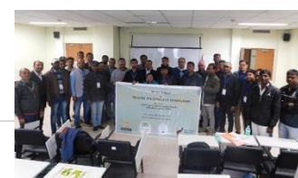
Fig 4 : Winter School 2019

scheme: Incubation centre has been selected by MSME NSSH to