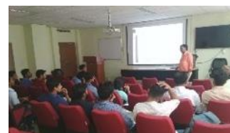
Fig 9 : Training Programs

Incubation Centre IIT Patna has also participated in the IEEE-iSES at NIT Rourkela to promote the research and development of IIT Patna and Incubation Centre IIT Patna.