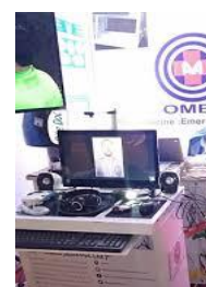
Fig 3 : Telemedicine Platform