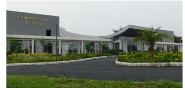
Fig 10.: Construction Progress

The construction activity has commenced immediately after the ground breaking ceremony of the IC permanent facility by Honble Dy CM of Bihar Shri Sushil Kumar Modi on 24 th November 2018. At present, the building is almost complete (Figure 10) and is expected to be handed over in year 2020. The building will host incubated companies and advanced technical labs including cleanroom, in addition to a library, recreation facilities, and guest rooms for visiting experts, meeting and conferencing facilities, class rooms and a cafeteria. The excellent design and well landscaped premises makes the facility a really attractive proposition for startup community.