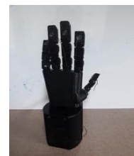
Fig 2 : Active Prosthetic hand