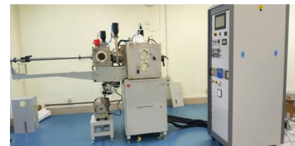
Fig 8 : RF DC Sputtering Machine

Office: The companies are provided access to work space that has professional grade furniture, computers, internet connectivity, ample storage, printers and housekeeping. A facility where 100 people is coming up rapidly.